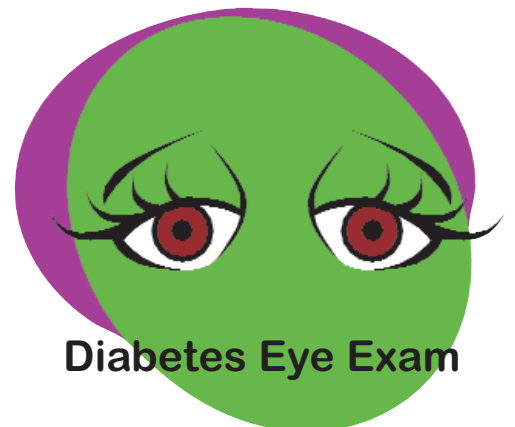
Diabetes Eye Exam