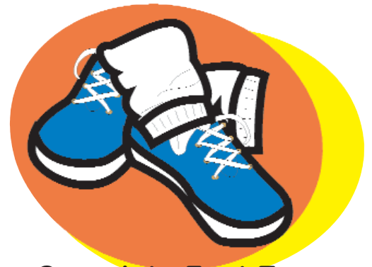
Complete Foot Exam