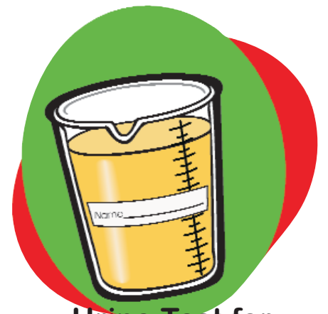
Urine Test for Kidney Function